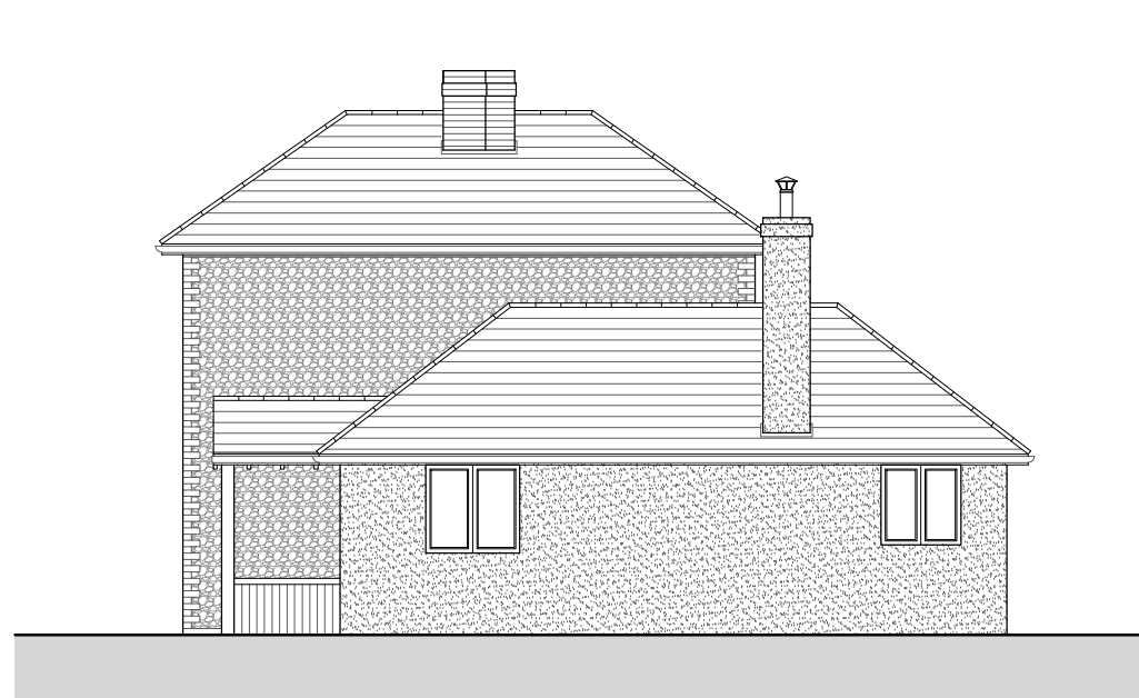
EXISTING RIGHT FLANK ELEVATION